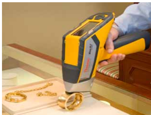
Jewelry analysis using a Thermo Scientific Niton XL2 analyzer.