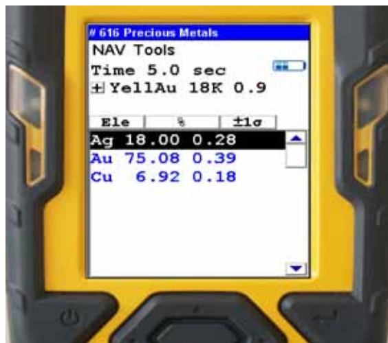
Example of 18k gold analysis.